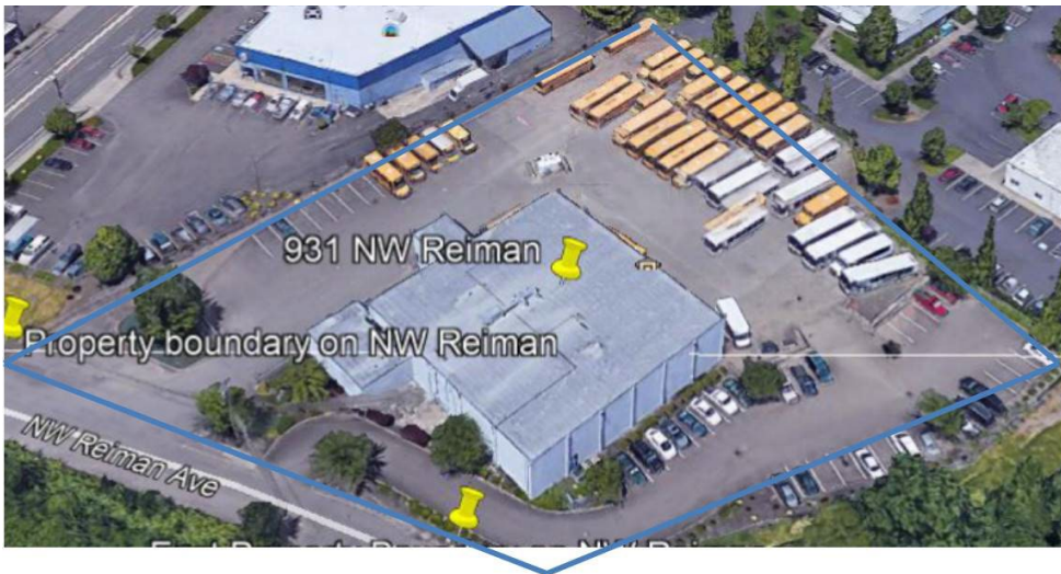
Benton Center North – 931 NW Reiman