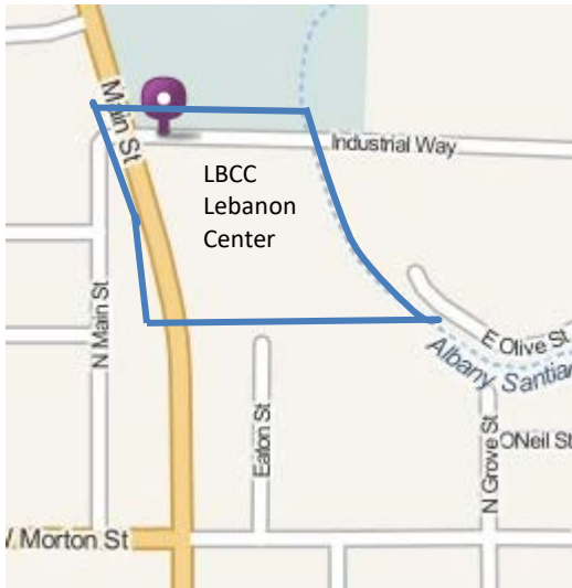
Lebanon Center 44 Industrial Way, Lebanon