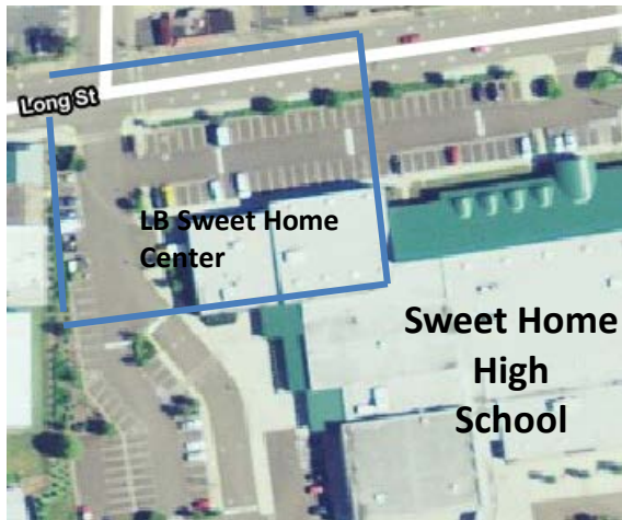
Sweet Home Center – in Sweet Home High School

Health Occupations Center 300 Mullins Dr., Lebanon